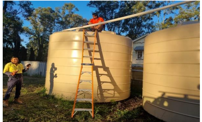
Ramesh Rai and Karandeep Singh connecting the water tanks to the shed. Rainwater is collected for use in the toilets and gardens.